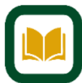
Extended Project Qualification (EPQ)