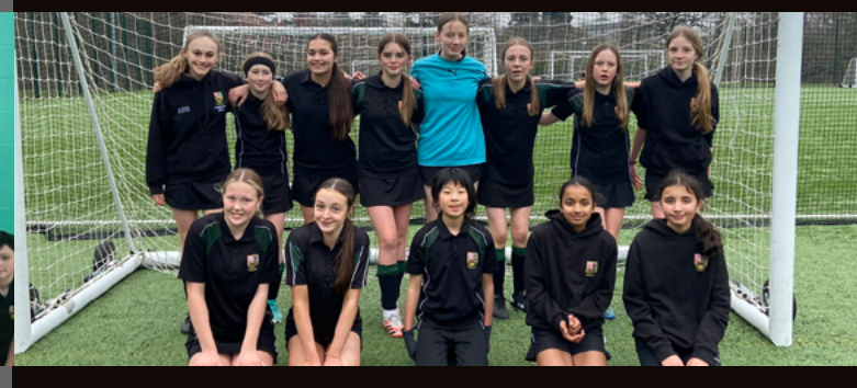
Our U13's played in their final satellite competition of the season. Well done to both teams!