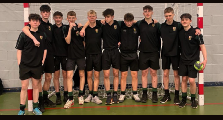
Well done to our U15s handball team! West Midlands winners and through to the regionals in Gloucester!