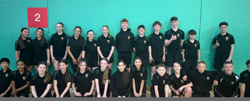
Well done to our Year 7&8 girls and boys who competed brilliantly at the Sportshall Athletics Competition.