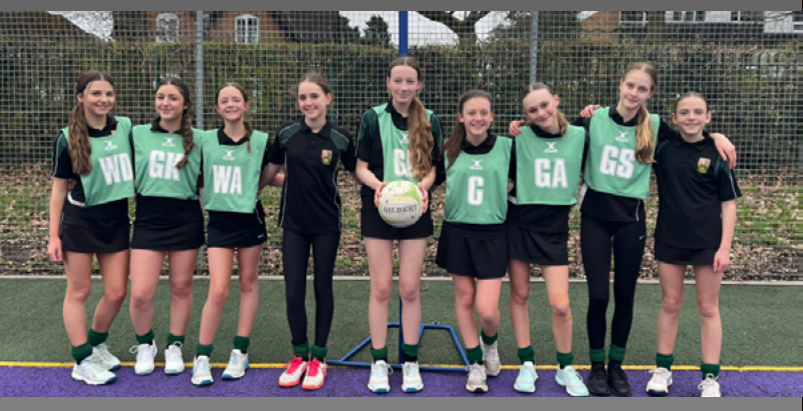
Congratulations to the Year 8 netball team who won the Solihull Schools Netball Tournament! An inspirational team!