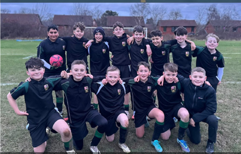
Year 7 Drew 2-2 and won 4-1 on penalties v Kings Norton Boys in the Birmingham Cup. Well done!