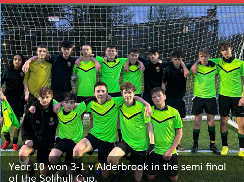
Year 10 won 3-1 v Alderbrook in the semi final of the Solihull Cup. They are now into the final!