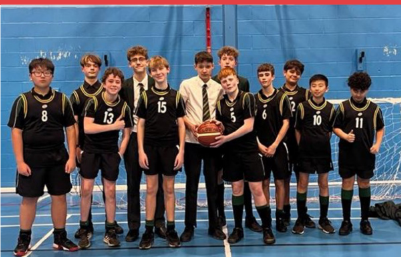
Year 9 basketball lost in semi final, but they played brilliantly and with so much heart! Well done boys!