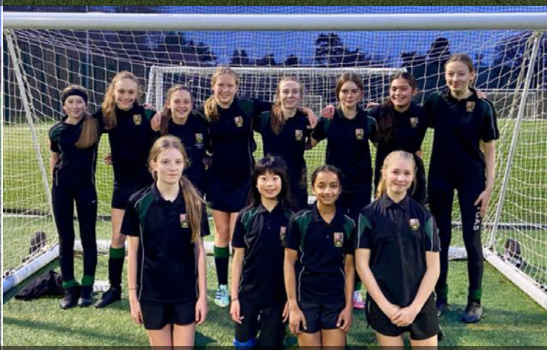
U13 girls at the Solihull Football Satellite Competition. Our girls smashed it, winning all their games! Congratulations!